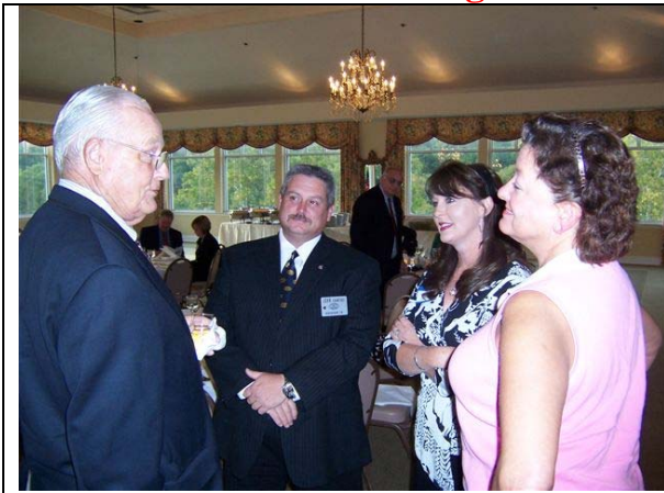
Members and guest socialize before last year's event.